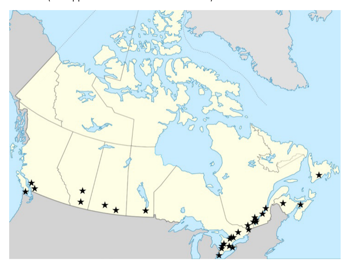
Figure 1. Map of Canada and location of participants' institutions (see appendix A for names of institutions)

This study focused on Canadian Association of Research Libraries (CARL) university member institutions. In so doing, a purposeful sample was developed that included one participant from each of the 29 academic libraries belonging to CARL (see Figure 1 below and Table 1 following page).