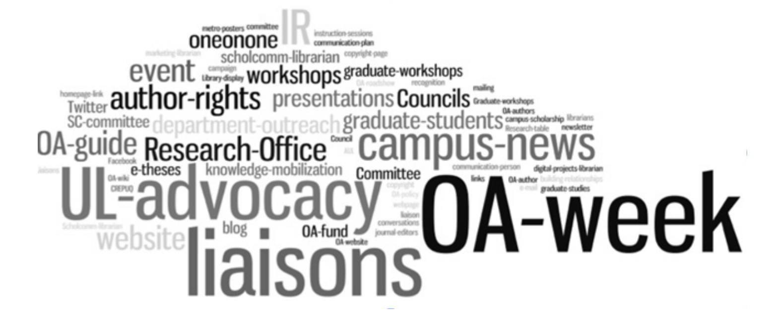
Figure 3. Words used by participants related to promotion and advocacy of SC issues in CARL institutions

In addition to personal advocacy efforts, whether from ULs, LLs, or others, participants valued the development and use of guides, library websites, and campus news channels to promote SC. Social networking tools such as blogs and Twitter were also mentioned as new methods being used by libraries to complement other outreach efforts.