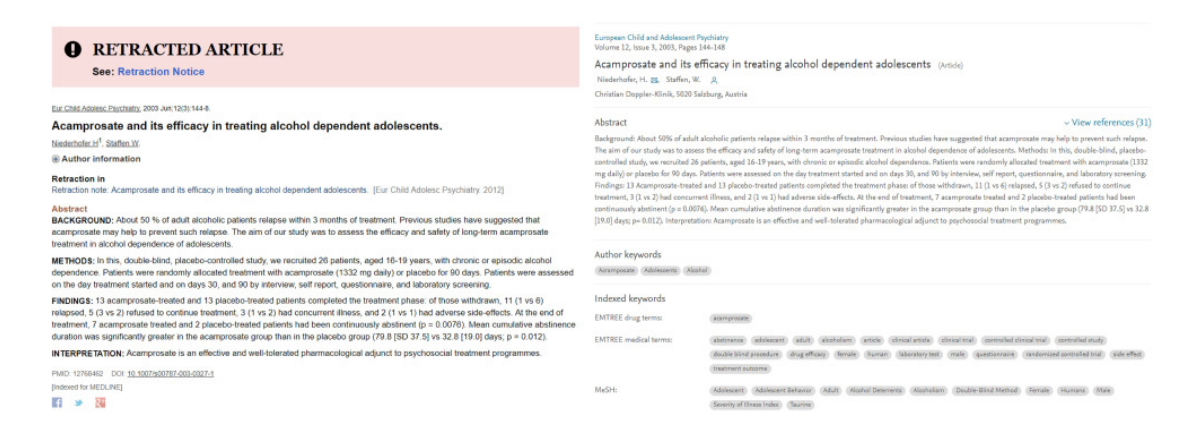
Figure 3. Article records from PubMed (left) and Scopus (right), the latter of which does not indicate that the article has been retracted

Of the 812 records studied, 487 (60.0%) indicated that the article had been retracted.