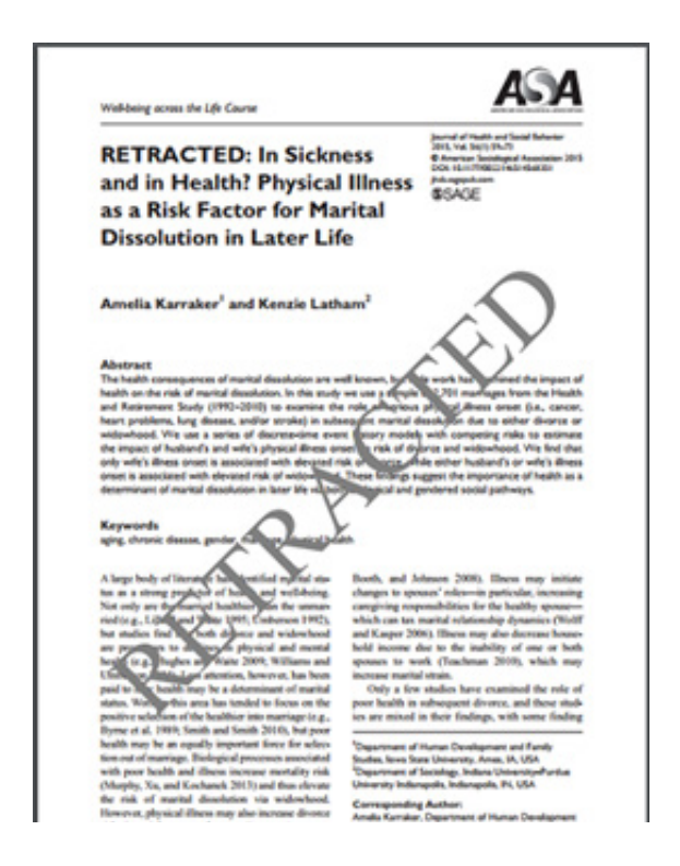
Figure 7. Article PDF marked as "Retracted"

Of available PDFs, 73.6% (148/201) show that the articles have been retracted. In 79.7% of cases (118/148), the retraction is noted in one place on the PDF, and in 20.2% (30/148) of cases, the retraction is noted twice. Where the retraction was noted once, this was most commonly done by writing "Retracted" across all PDF pages (n=82, 69.5%, see Fig. 7). This was also the most common strategy when the retraction was noted more than once (n= 30, 100.0%). Other strategies included adding the retraction notice to the beginning (n=28) or the end of the article (n=19). In 17 instances, the original article was removed and replaced with the retraction notice.