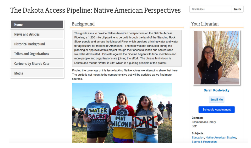
Figure 1. Screenshot of home page of UNM DAPL LibGuide

Once the format was chosen, organization decisions followed. Many academic library Lib-Guides are created to help students find resources for their coursework, and the organization reflects this purpose with pages labeled "Scholarly Articles" or "Subject Databases," terms not in common use outside academia. The DAPL guide does not incorporate academic or library jargon, in an effort to make information accessible to both campus users and the larger community. Two library colleagues from UNM's Indigenous Nations Library Program<sup>5</sup> and I composed the initial guide structure. After shaping the layout together, I assumed responsibility for curating content and overall guide maintenance. The DAPL LibGuide pages are: News and Articles, Historical Background, Tribes and Organizations, Cartoons by Ricardo Caté, and Media (more on the cartoons later).