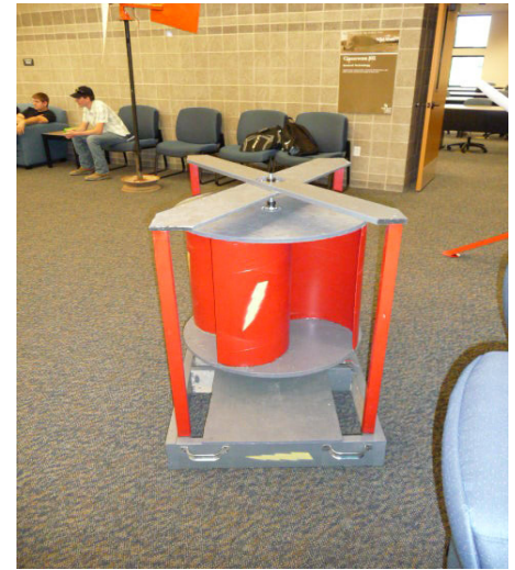
Figure 1: A Homemade Savonius Wind Turbine

generally less than 1. Figure 1 shows a student built Savonius wind turbine.