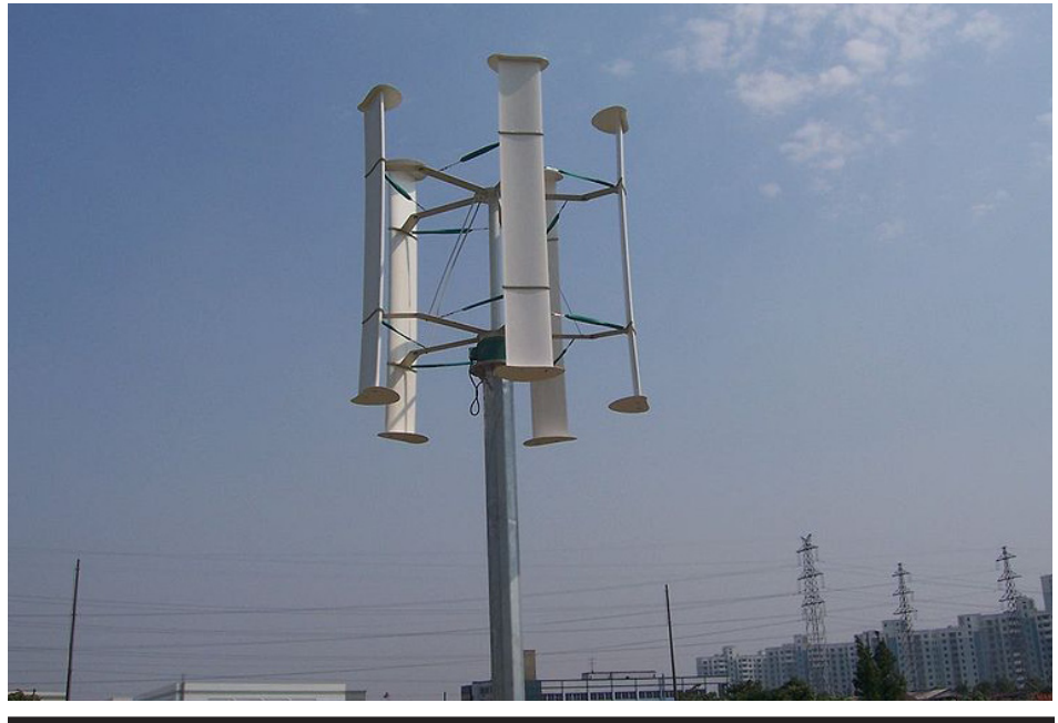
Figure 2: A Modern H-Rotor Darrieus Wind Turbine

Because VAWTs can intake wind from any direction, they can operate in turbulent and variable wind conditions far better than HAWT designs (Berry, 2009). In fact, VAWTs can often operate in higher wind speeds than their HAWT counterparts which equates to greater energy generation under these conditions. These advantages have led both designers and politicians to consider adding VAWTs to urban environments (Ragheb, 2008). VAWTs often have their gearbox and electrical alternator located near the ground which facilitates easier maintenance. Some new VAWT designs have a coefficient of performance approaching 0.40 and allow for greater turbine density per parcel of land (Allan, 2007). Marsh (2005) notes that new H-rotor VAWT designs may also break the 10 MW barrier as the orientation of the blades coupled with modular manufacturing techniques allow VAWTs to be constructed larger than HAWTs. However, there are reasons why VAWTs have not seen more widespread use in wind farms.