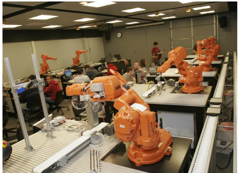
Figure 1. An integrated manufacturing laboratory.