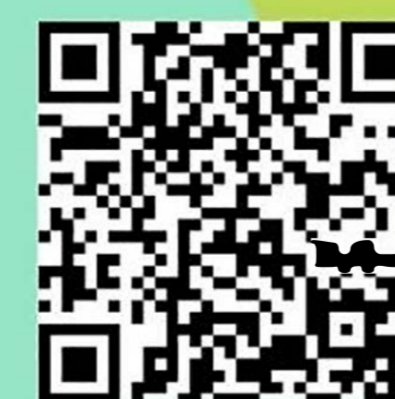
Check out The Prospectus in SPARK