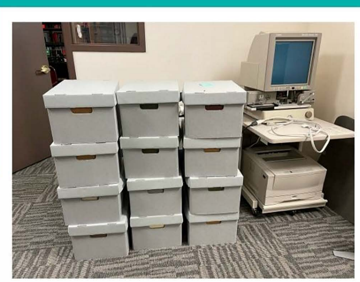
Before: Banker's boxes of issues donated by The Prospectus offices

Access will be provided through two separate repositories based on digital preservation standards and the features offered by each. Individual issues will be available as PDFs on Parkland's digital repository, SPARK. These are in the process of being batch uploaded by a University of Illinois practicum student. The Illinois Digital Newspaper Collection (IDNC) offers full-text search capabilities for the newspapers on their website: https://idnc.library.illinois.edu/