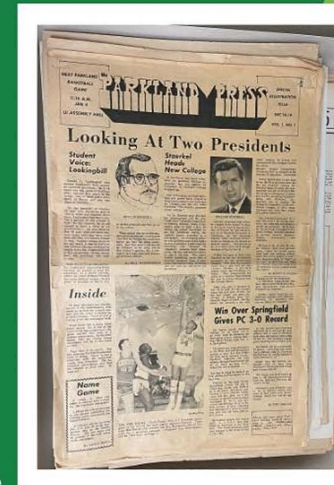
First Issue December 18-19, 1968