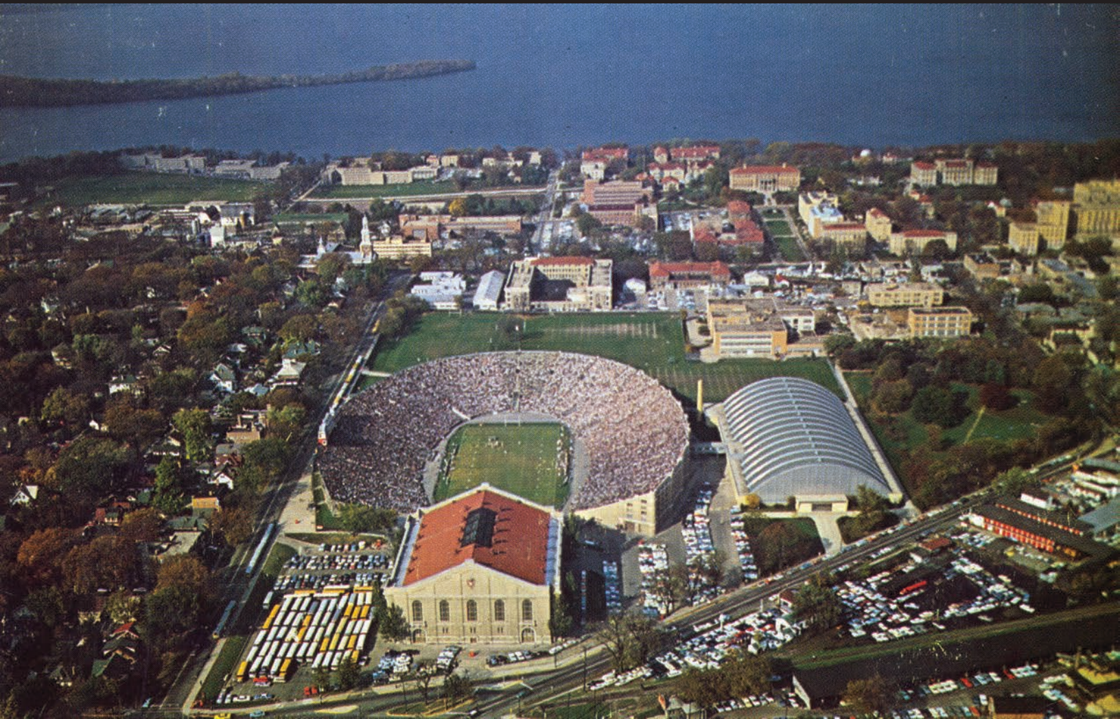
Aerial view of Camp Randall Stadium during a football game on the University of Wisconsin–Madison campus with Picnic Point in the background.