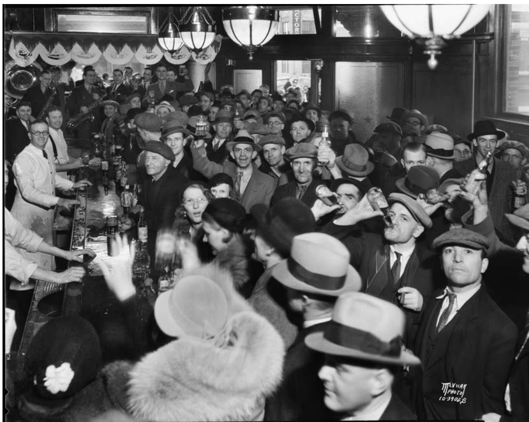
Slightly elevated view of crowd in the Fauerbach Brewery tavern at 651 Williamson Street, with men and women drinking and toasting and celebrating the end of Prohibition. A small band plays in the background. Wisconsin Historical Society, Image ID 3493.