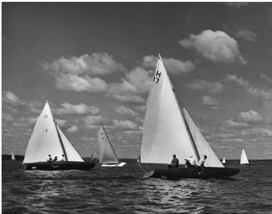
A sailboat race on Lake Mendota. Wisconsin Historical Society, Image ID 142175.

Session Type: Lightning Talk LIVESTREAM MASKS REQUIRED