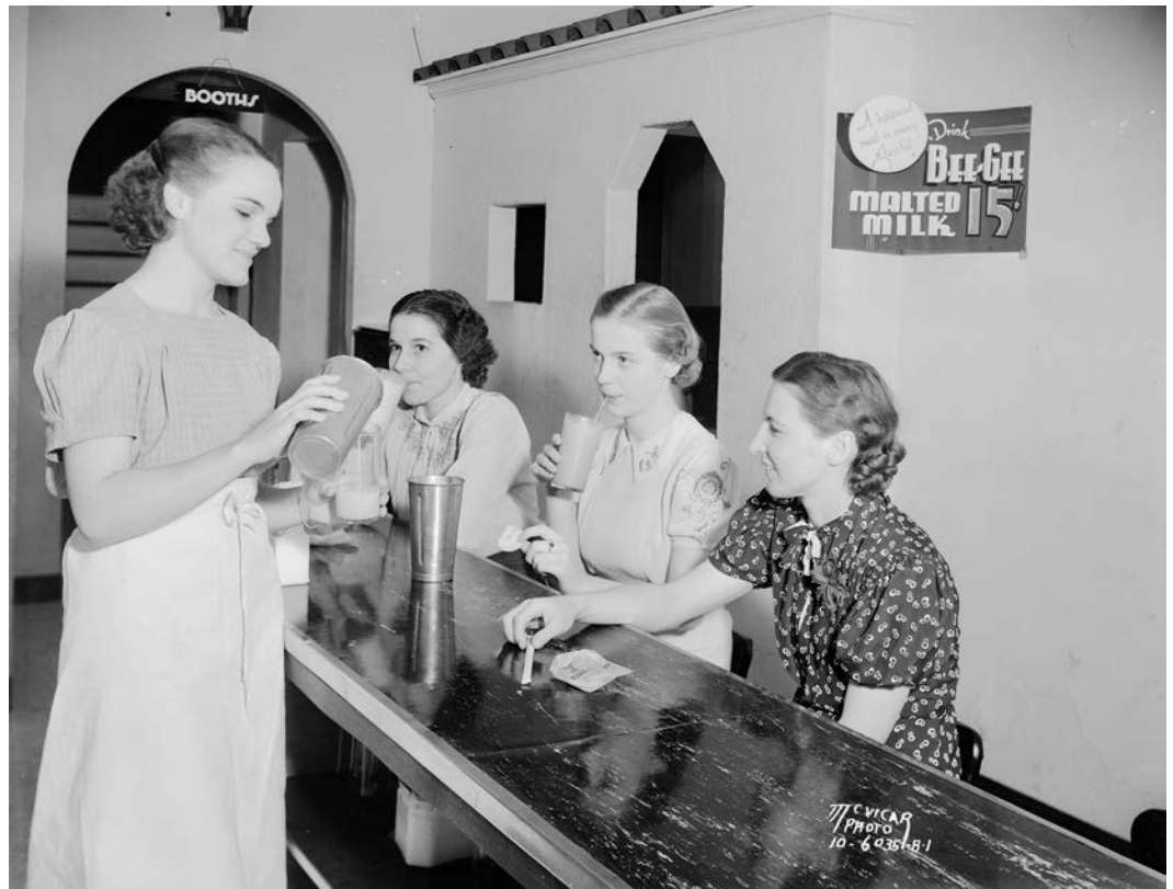
A soda jerk pours a malt into a glass as three women sit at the counter of McCoy’s Ice Cream Parlor, located at 507 State Street. Wisconsin Historical Society, Image ID 14981.