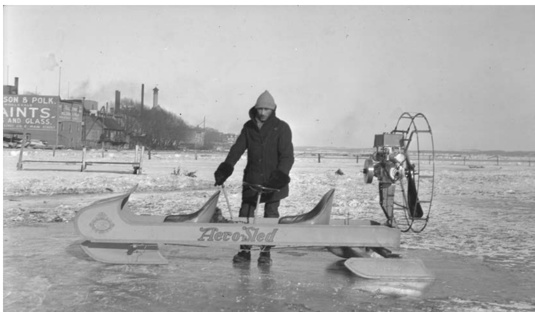
A man dressed in winter clothes is standing behind an Aero-Sled iceboat, which has a motor and a propeller on the back. The boat is near the Lake Monona shoreline. In the background is the Jackson and Polk Paints store at 218 East Main Street.

Session Type: Lightning Talk MASKS REQUIRED