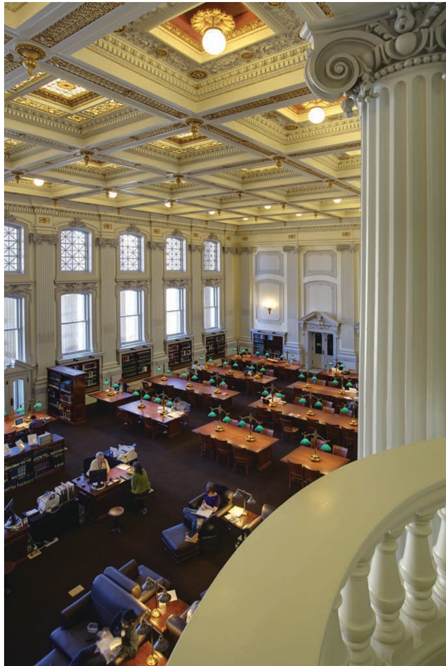
View of the reading room at the Wisconsin Historical Society.