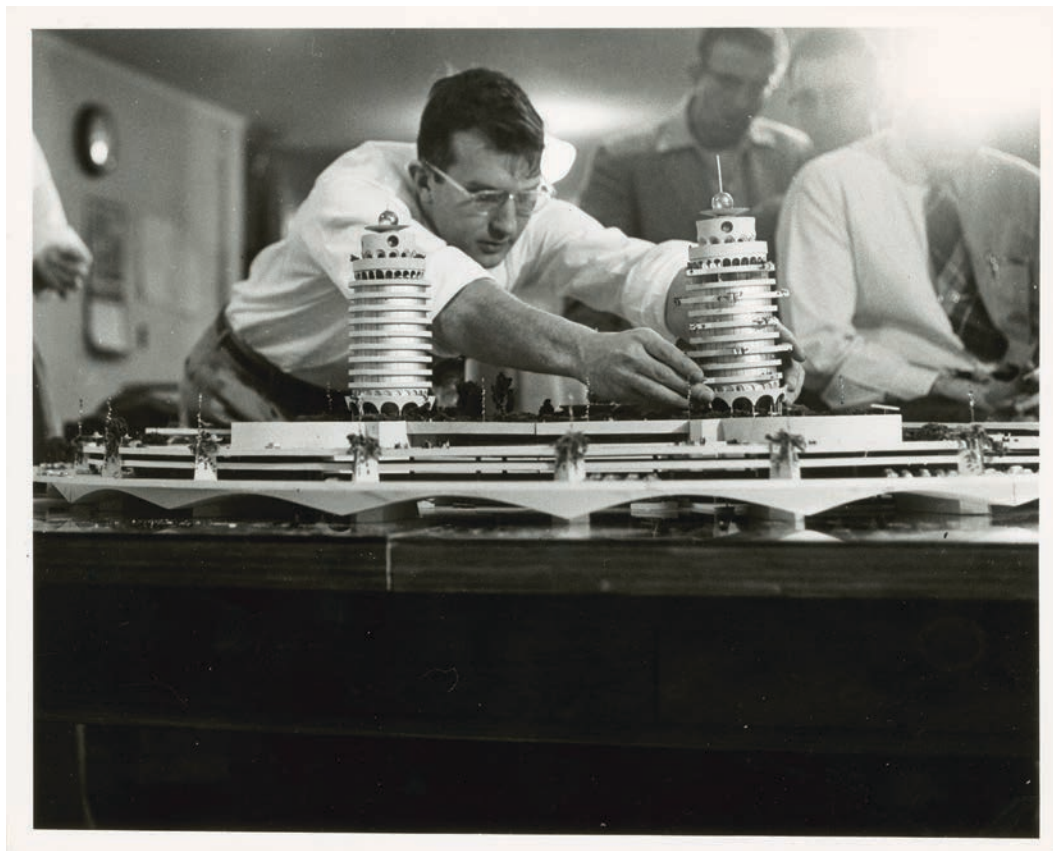
An architect sets a tower on an architectural model of Monona Terrace.