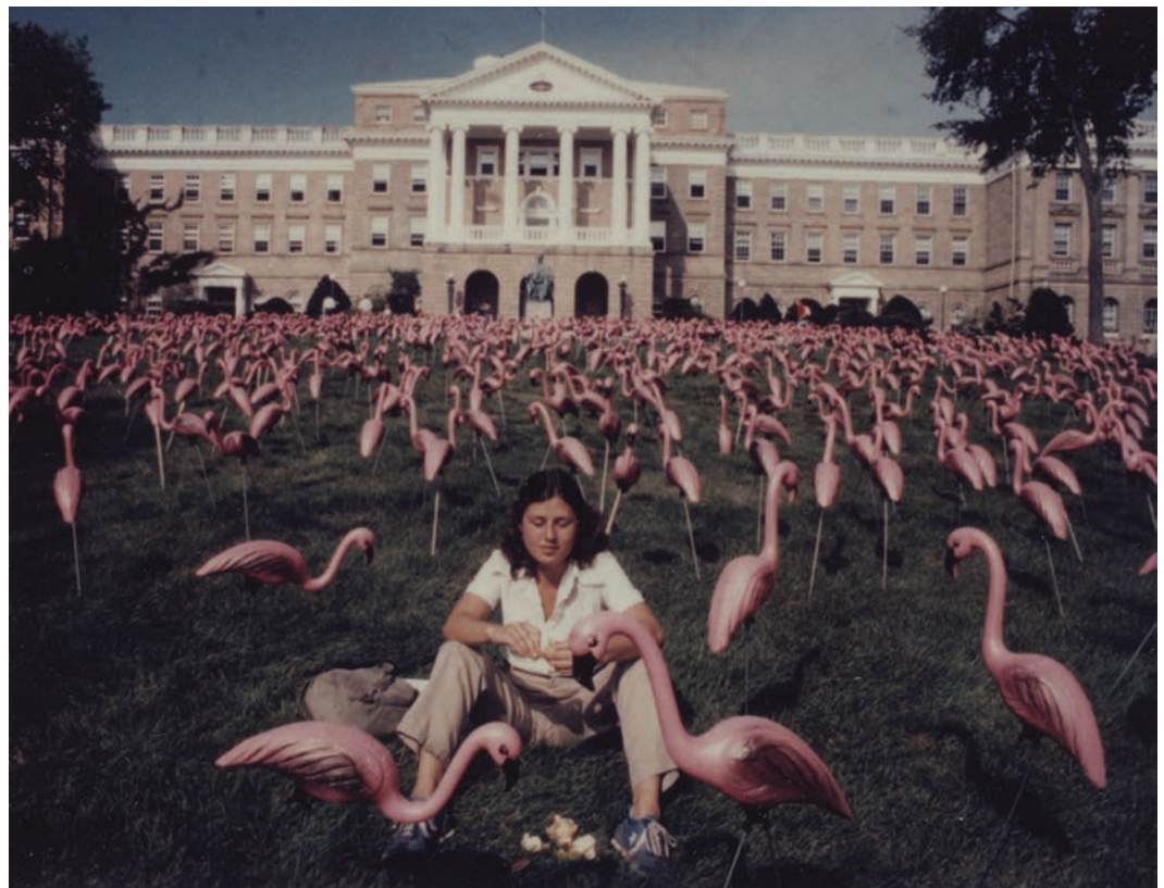
View uphill toward a woman sitting among a flock of pink flamingo lawn ornaments covering Bascom Hill. She is pretending to feed bread to two pink flamingos in front of her. Bascom Hall and the Abraham Lincoln statue are in the background.