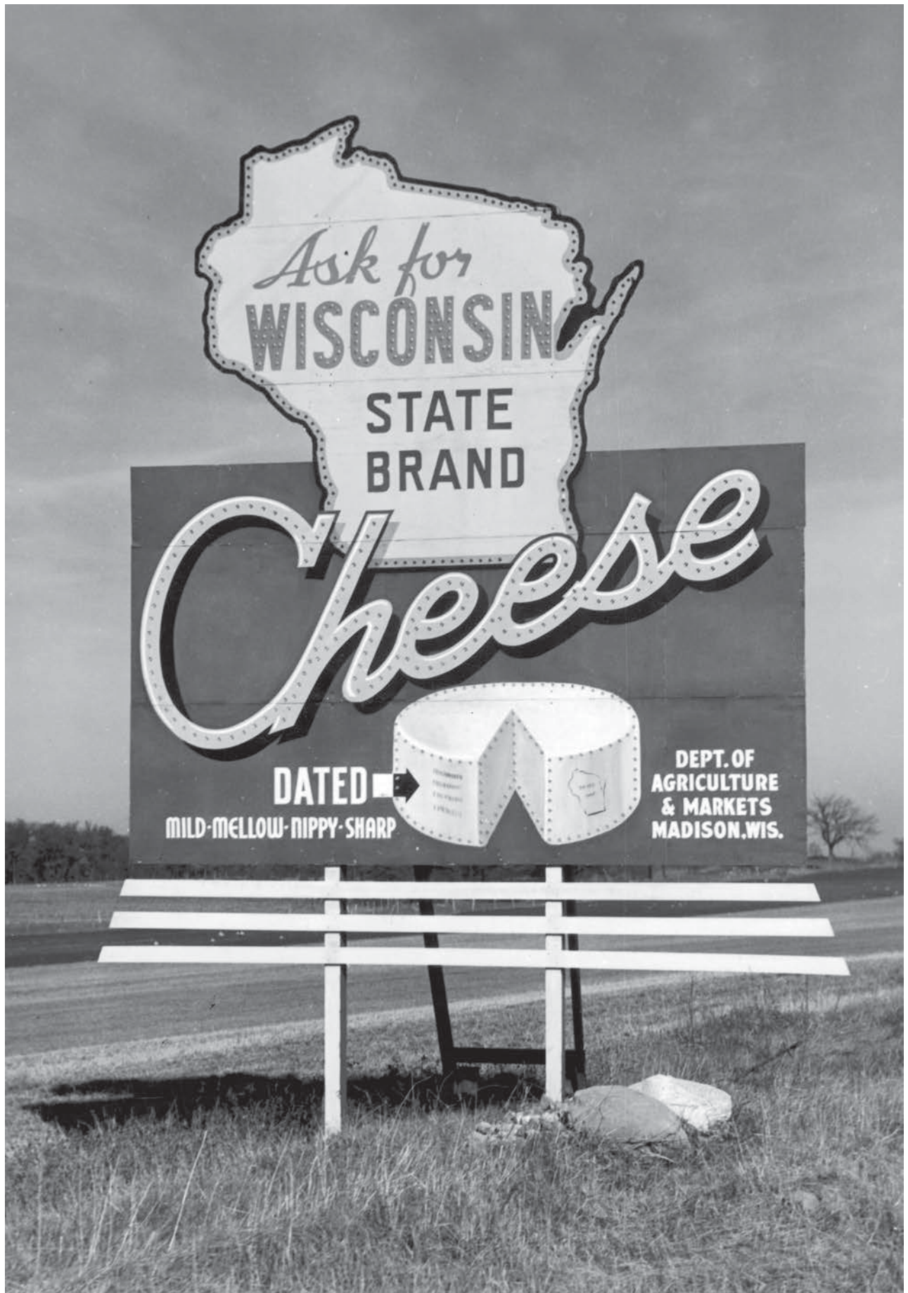
Highway billboard advertising Wisconsin cheese for the Department of Agriculture and Markets.