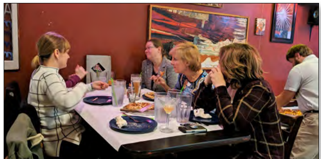
Some attendees chose to network over dinner at Rhombus Guys, a pizza restaurant in downtown Fargo.