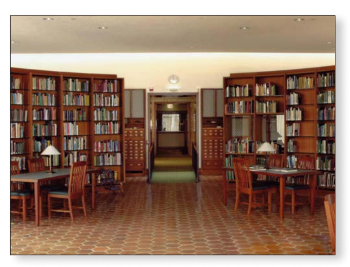
Sterling Morton Library Reading Room entrance.