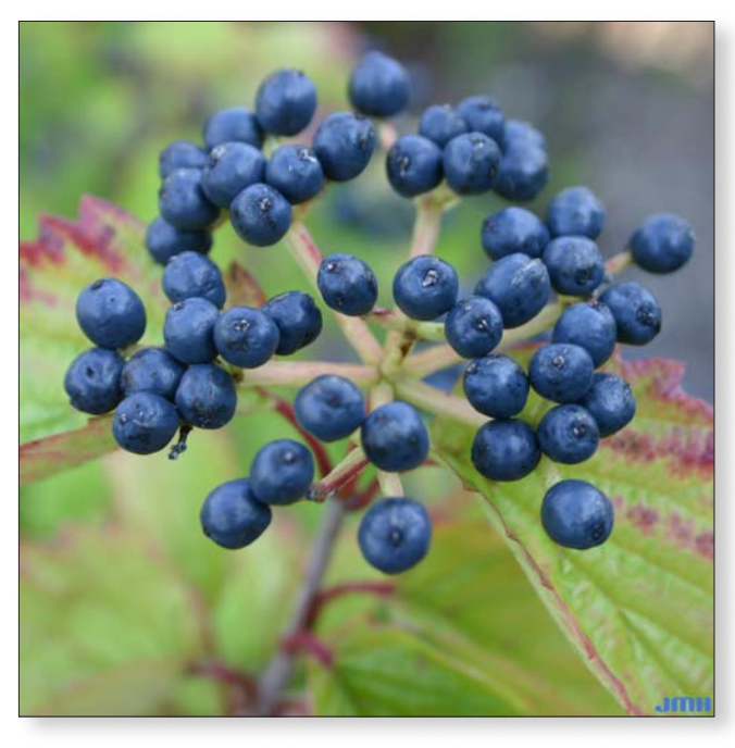
Viburnum dentatum (southern arrowwood), cluster of fruits and drupes.

Through these unprecedented times, the Sterling Morton Library (of the Morton Arboretum) in Lisle, Illinois, outside of Chicago, has had to adapt and evolve to accommodate the current circumstances. Since the temporary closure of the arboretum, the library has transformed many of its in-person services and projects into digital endeavors. Additionally, the library has been proactive in archiving the arboretum and its staff's responses to the current climate.