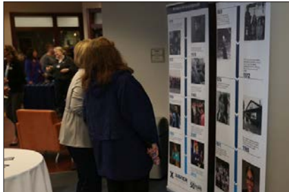
Xavier staff members view 50th-anniversary display.

the trailblazing women who came to Xavier as undergraduates in 1969.