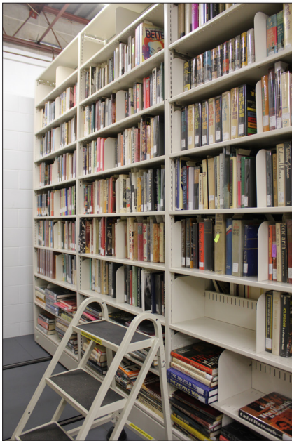
A before-and-after view of shelving