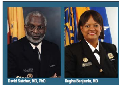
Family physicians who served as Surgeons General: David Satcher, MD, PhD (1998–2002) and Regina M. Benjamin, MD (2009–2013)

the small “pocket-size” booklet is designed to give a brief history of the specialty to family physicians, students, residents, and members of the public to help educate them on the history and evolution of family medicine. For more information, or to order copies of the Pocket History , please visit the AAFP Foundation website at http://www.aafpfoundation.org/chfm . The Center for the History of Family Medicine serves as the principal resource center for the collection, conservation, study, exhibition, and dissemination of materials relating to the evolving history of the specialty of family medicine in the United States for the benefit of the specialty and the public.