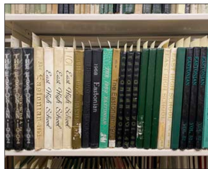
Yearbooks in the stacks of the Missouri Valley Special Collections

More than 1,100 high school yearbooks were recently added to the Kansas City Public Library's digital history site, KCHistory.org. Missouri Valley Special Collections staff worked for over two years sending yearbooks off-site for scanning, overseeing their safe return, and creating metadata for each volume. The yearbooks were uploaded to the site as text-searchable PDFs that can be downloaded and shared by users. The bulk of the schools represented are from the Kansas City, Missouri, School District, but others from surrounding communities and a few from outside of the immediate Kansas City area have also been added. While in the past using the collection required a visit to the research room, now researchers interested in genealogy, history, or simply taking a trip down memory lane can access this high school yearbook collection from home free of cost and with no need to register with a website.