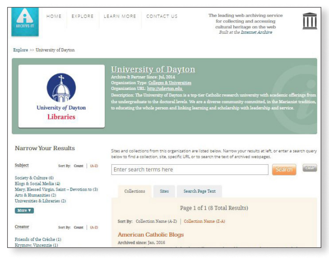
The University of Dayton Libraries' Archive-It Collection homepage at https://archive-it.org/home/udayton

The University of Dayton purchased a subscription to Archive-It in 2014 to begin capturing web content that fit within the collecting scope of each of the three special collections areas, including the Marian Library, the US Catholic Special Collection, and the University Archives and Special Collections. Archive-It allows users to harvest, organize, and catalog their collection materials and then access them through the Archive-It website, where each institution has a homepage with a search box and facets.