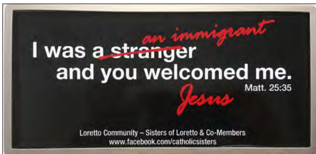
Billboard located at the entrance to the Loretto Motherhouse Campus

My week-long trip was a blur of activity. I was graciously hosted in the home of three Sisters, who made sure to host dinner parties with members of the community for me to meet. I was taken on tours of past Loretto schools by Sisters who had personal connections to the grounds and who told me wonderful stories I would not have been able to find in the administrative papers housed in the collections. Recognizing the importance of capturing these vignettes of past days, we have begun asking community members to write up short pieces relaying memories that have shaped their experience of Loretto.