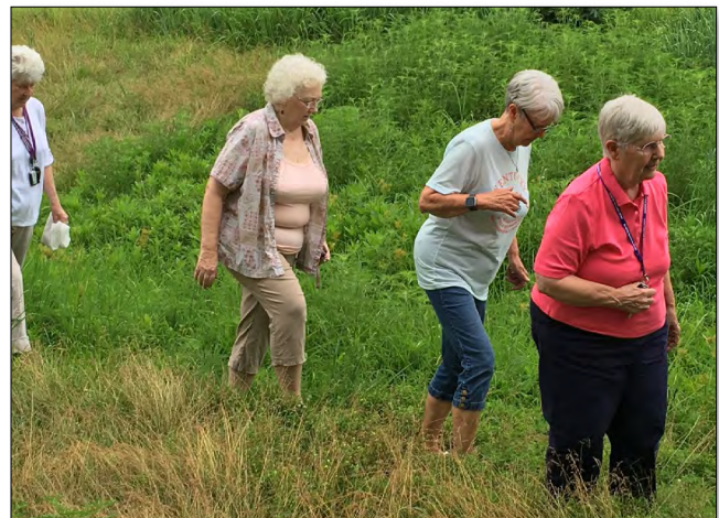
Loretto Community members stand in wagon ruts along the Santa Fe Trail.

While learning the long past history of the order is important, I would not be able to successfully perform my role as archivist without also learning about the more recent history and the current affairs of the community. The events of today will shape our understanding of history tomorrow, and gathering memories from the aging community members is a time-sensitive task. During the trip, I got to know several of the Sisters and Co-Members personally. Building a rapport with members of the community is indispensable, as it not only strengthens the trust of potential donors, it also creates contacts within the community with whom I can discuss my questions without fear of accidentally alienating people. Religious communities are inherently private and have only recently begun to open their materials to lay professionals and researchers. Continuing to foster a relationship of trust and mutual respect between the lay archival staff and the community is an ongoing responsibility that I work on every day. This trip to Santa Fe certainly strengthened the relationships we are building.