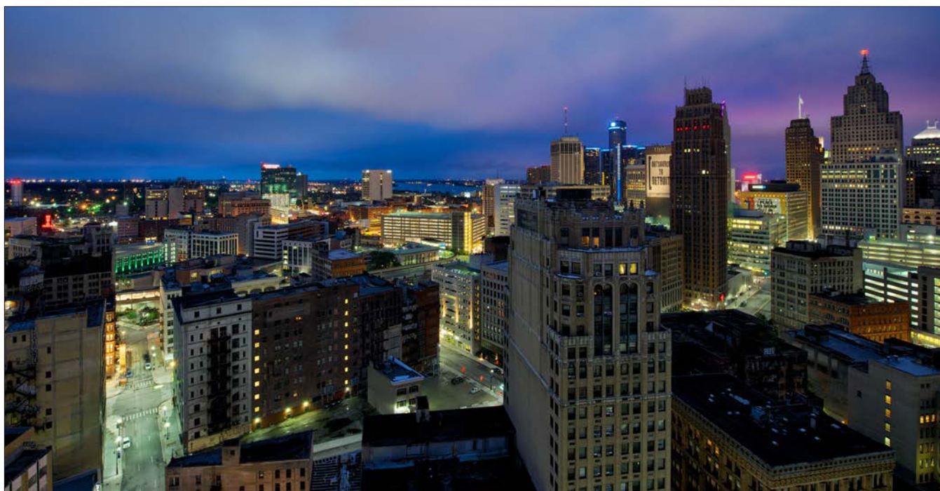
“Detroit From The Top Floor,”