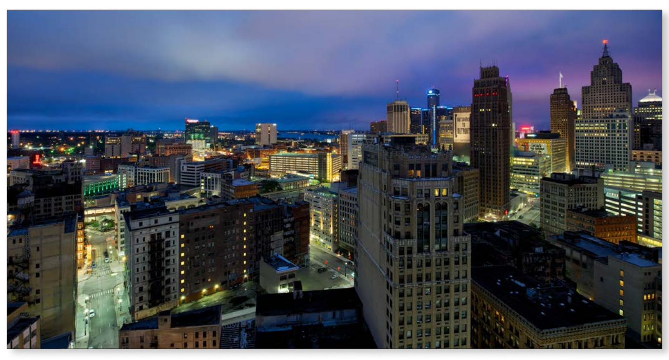
"Detroit From The Top Floor," by Mike Boening Photography, Flickr(CC BY-NC-ND 3.0) https://flic.kr/p/eZu9VK