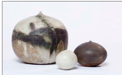
Toshiko Takaezu, three untitled pieces, n.d.