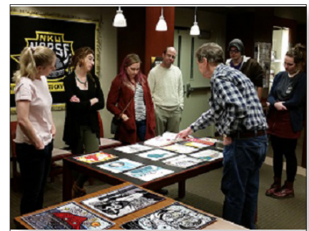
Graduate English class studies art interpreting Moby-Dick.