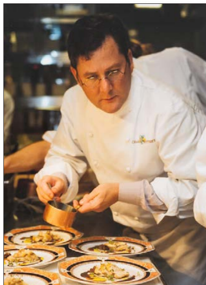
Charlie Trotter, undated.

Purdue University Archives and Special Collections is excited to announce the launch of the Purdue Facilities and Buildings Historic Database, a digital