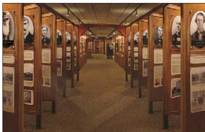
Hall of Riders.