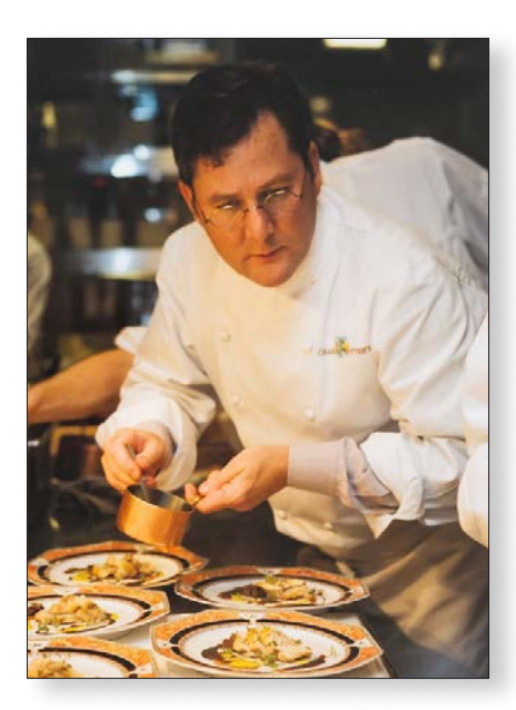
Charlie Trotter, undated.

Purdue University Archives and Special Collections is excited to announce the launch of the Purdue Facilities and Buildings Historic Database, a digital