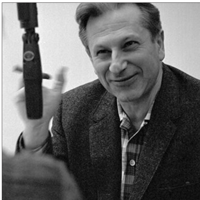
Studs Terkel in the studio

Ten years ago, the world lost the inimitable oral historian and broadcaster, Studs Terkel, at the age of 96. During his time with us, Studs authored several acclaimed works of oral history, such as Hard Times: An Oral History of the Great Depression and The Good War —an oral history of World War II that won the Pulitzer Prize for General Non-Fiction in 1985. However, in his hometown of Chicago, Studs was perhaps best known for The Studs Terkel Program , the long-running radio show he hosted on WFMT, Chicago's fine arts and classical music station. Ask around Chicago long enough, and residents of a certain age will come bursting forth with warm feelings that might seem more appropriate for a relative than a radio show host they never met, at least it might seem that way if you'd never heard the man talk.