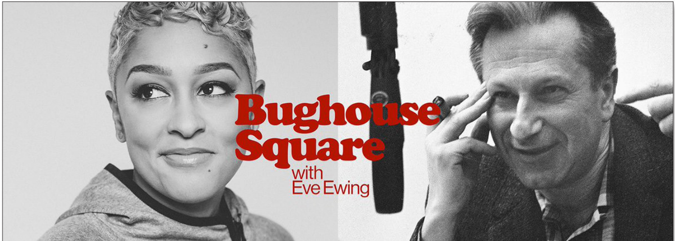
The podcast to connect listeners with Studs's work

As much as the archive acts as a window to our collective past, it does not simply reside there. With our Remixer tool, users can splice audio from several different transcribed conversations and combine them to create their own original piece of audio. Together with the Chicago Public Library and the Great Books Foundation, we have developed a series of curricula based around audio from the archive for students in grades 7–12. Topics, so far, include language arts, history, and the civil rights movement—all are free for download from our site.