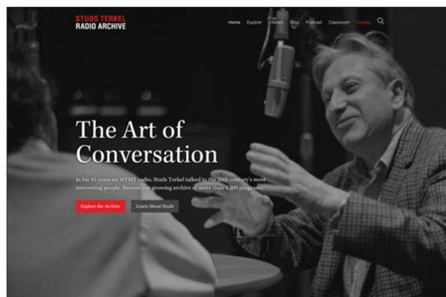
Home page of the Studs Terkel Radio Archive site