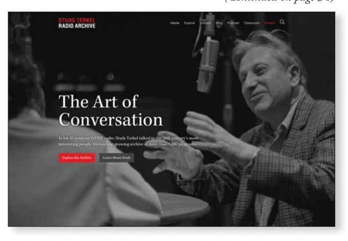
Home page of the Studs Terkel Radio Archive site