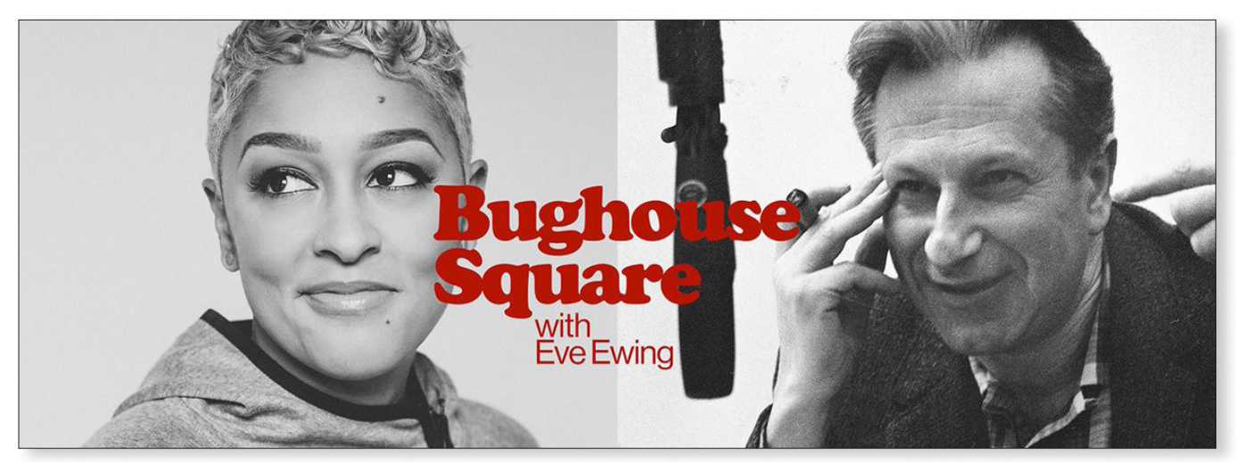
The podcast to connect listeners with Studs's work

As much as the archive acts as a window to our collective past, it does not simply reside there. With our Remixer tool, users can splice audio from several different transcripted conversations and combine them to create their own original piece of audio. Together with the Chicago Public Library and the Great Books Foundation, we have developed a series of curricula based around audio from the archive for students in grades 7–12. Topics, so far, include language arts, history, and the civil rights movement—all are free for download from our site.