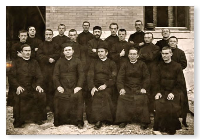
The first SVDs during construction of their community in Techny, IL, 1900

The SVD community was also quite pleased with the exhibit, though for some, the idea of a completely virtual exhibit was confusing. "What's a digital exhibit?" was a question we heard many times during the exhibit's development. Many of my colleagues working in academic archives benefit from students and faculty who are comfortable with a wide array of digital tools and platforms (or at least the concepts behind them), but religious archivists often find that our older community members are not nearly as well versed. For them, viewing an exhibit means an in-person encounter with physical materials.