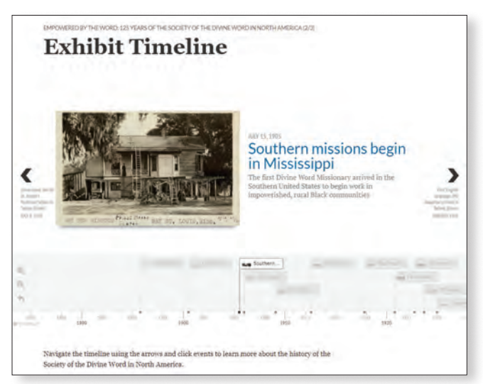
A portion of the centerpiece timeline of Empowered by the Word

An anniversary is a celebration of time, so it made sense to make Scalar's interactive timeline tool the centerpiece of the exhibit. I find Scalar's timeline to be both striking in its design and intuitive to use. However, as exhibit design progressed, it became clear that the points on our 125-year timeline (which link to exhibit pages discussing the respective events) needed to be at least three years apart to maintain real visual impact. Unfortunately, historical events tend to happen in fits and starts rather than at a uniform rate.