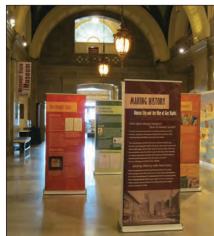
Photograph of the exhibit Making History: Kansas City and the Rise of Gay Rights at the Missouri State Museum before it was removed.

across the state from a variety of organizations, and UMKC received private funding to fabricate another traveling exhibit to meet the demand for requests to host the exhibit. We anticipate that Making History will be on display throughout Missouri for most of 2022, and others interested in the exhibit can visit the digital version ( https://info.umkc.edu/makinghistory/about-this-project ).