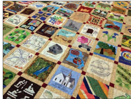
Bicentennial quilt. State Historical Society of Missouri.

exhibits, storytelling, oral history recordings, and Missouri music took center stage at festivals throughout the year. Missouri Statehood Day included an old-fashioned ice cream social that took place in 198 venues with the official commemoration at the Missouri State Capitol and a Naturalization Ceremony to welcome new Missourians.