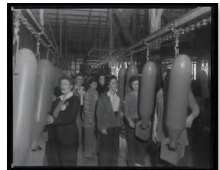
Women employees handling bombshells in a Niedringhaus Metal Products Company war plant at 5739 Natural Bridge Avenue, St. Louis, Missouri. Photo by Sievers Studio, January 13, 1943. Missouri Historical Society Collections.

Thanks to the support of the Institute of Museum and Library Services' (IMLS) Museums for America grant program, the Missouri Historical Society launched the three-year project Seeing 1940s St. Louis: The Sievers Studio Collection in late 2018. The project's mission was to fully process, rehouse, and selectively digitize the Sievers Studio Collection's Series 4 photographic materials and open the series for public access and use. The collection itself contains the surviving work of Sievers Studio, a commercial photography studio active in St. Louis from 1917 to 1989. Series 4 encompasses the studio's work in the 1940s, showing firsthand daily life in 1940s St. Louis and fully embodying studio founder Isaac Sievers's motto "I photograph anything." The project ended in November 2021, unlocking over 76 linear feet of materials to the public eye. See https://mohistory.org/collections/item/P0403 for more details about the collection, its available series, and its digitized images.