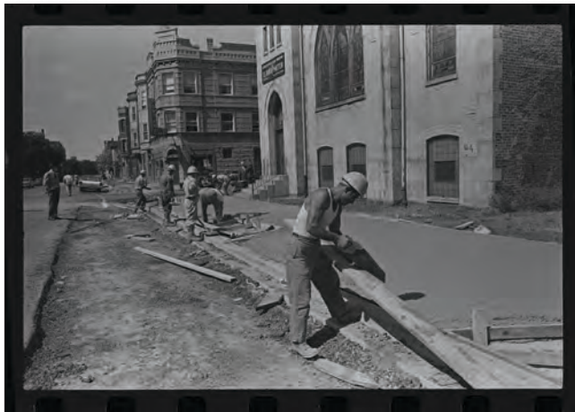
Sidewalk construction, West Polk Street, undated. Chicago Department of Urban Renewal Records.

The Special Collections Unit at Harold Washington Library Center holds the Chicago Department of Urban Renewal Records, 41 linear feet that include additional images, documents, and publications not visible in the digital collection. The nearly 16,000 photographic negatives were difficult to access due to their format. This digital collection was made possible through generous funding from the Gaylord and Dorothy Donnelley Foundation.