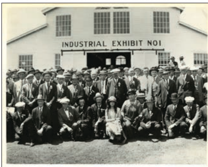
Group portrait of the Sognalaget, St. Paul, Minnesota.