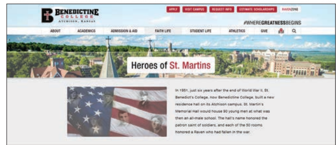
The landing page of the Heroes of St. Martin's project. Access the online exhibit at www.benedictine.edu/StMartinHeroes .