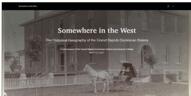
“Somewhere in the West: The Historical Geography of the Grand Rapids Dominican Sisters” title slide