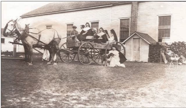
Sisters at their mission on Beaver Island, Michigan, in the late 1890s

Not long after, the Aquinas College archivist went to work in the archives of the Dominican Sisters. One of her first responsibilities there was to organize the sisters' annals.