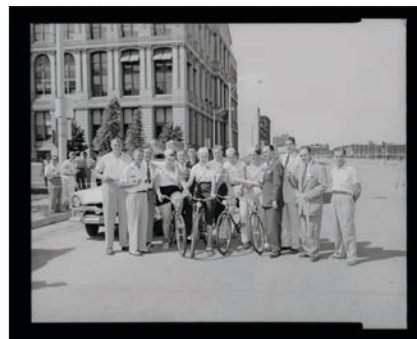
Bikes for Ike group posing with bicycles at the intersection of Third and Walnut Streets, St. Louis, Missouri. P0403-56430-01-4a.

Thanks to the support of the Institute of Museum and Library Services' (IMLS) Museums for America grant program, the Missouri Historical Society (MHS) is overseeing Picturing Postwar St. Louis: The Sievers Studio Collection, 1950–1969 , a two-year processing and digitization project that began in late 2021. The project's mission is to fully process, rehouse, and selectively digitize the Sievers Studio Collection's Series 5 and Series 6 photographic materials and open the series to the public. The collection itself comprises the surviving work of Sievers Studio, a commercial photography studio active in St. Louis from 1917 to 1989. MHS is pleased to announce that Series 5, which documents the studio's work in the 1950s, is now available for viewing. Encompassing over 32 linear feet, Series 5 provides an in-depth view of daily life in 1950s St. Louis. See https://mohistory.org/collections/item/P0403 for more details about the collection, its available series, and its digitized images.