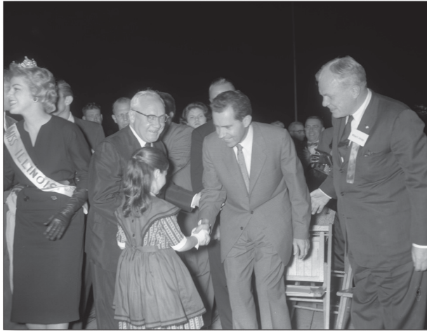
Vice President Nixon's presidential campaign visit to Springfield, 1960