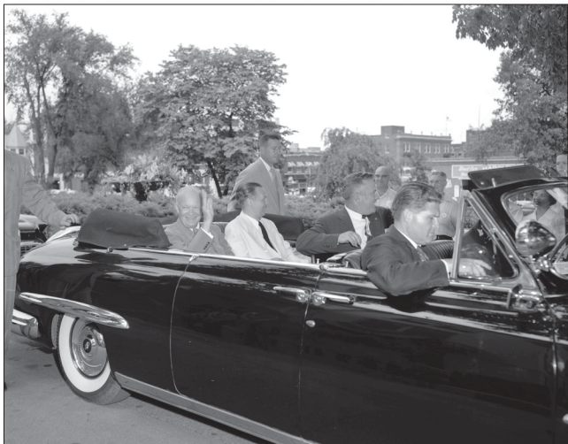
President Eisenhower visits the Illinois State Fair, 1954.