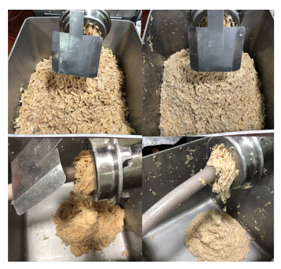
Figure 1. Visual difference in ground normal (NOR; left) and severe (SEV; right) wooden breast (WB) meat after 1/4 in grind (top) and 3/16 in grind (bottom).

from the carcass. Utilization in a chopped and formed product may be a viable option for SEV WB. Some processors sort out WB fillets to go into comminuted products, such as nuggets or patties (Crews, 2016). Therefore, it is important to research the impact that using WB has on product quality.