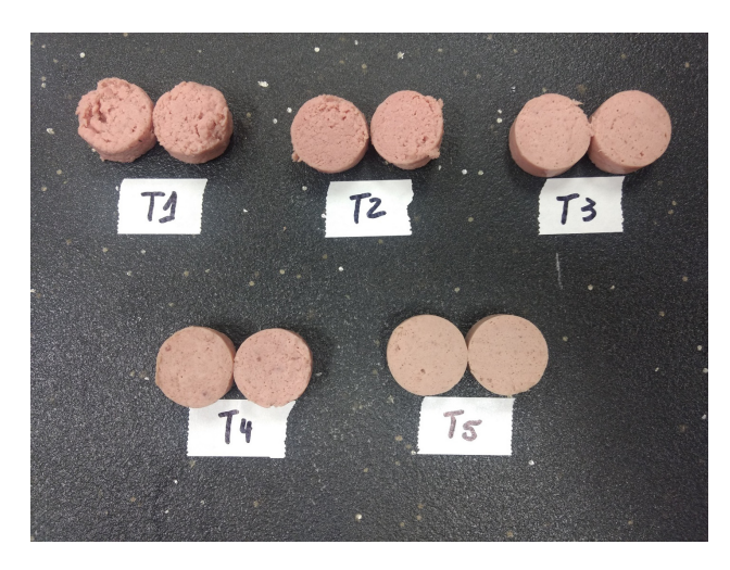
Figure 3. Prepared and cooked meat emulsions using residual sausage casing (RSC) as a partial or full replacement of a commercial binder ingredient. T1 = 100% RSC; T2 = 75% RSC; T3 = 50% RSC; T4 = 25% RSC; and T5 = 0% RSC.

According to Vasquez Mejía et al. (2019), hardness was generally greater when formulations included high levels of dietary fiber. This is because of the entrapment of water and fat within the fiber network, and these interrelations between fiber/hydrocolloid, water, and