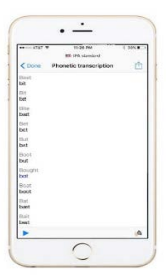
Figure 5. ToPhonetics app output: minimal pairs.

Once options are set, the user can enter text on the home page. An example of output is shown in Figure 5. In addition to the initial output presented on the screen, the user can double click any word to get the dictionary definition from the Oxford American Dictionary; the definition page also has an option to do an automatic Google search. In the case of words that are in blue, such as "bought" in Figure 5 above, double clicking will give both pronunciations; for /bought/, these are [bat] and [bɔt]. The file symbol at the top right corner gives various standard options for sharing and saving the output.