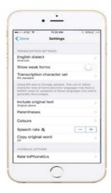
Figure 3. ToPhonetics app options.

The first option is "English dialect", which gives a choice between American or British English, with British English being the default (the app was originally designed for a European audience). The second option, "Show weak forms", is intended to represent some suprasegmental aspects, specifically the difference between "normal" and contextual pronunciation. So, for example, /to get/ is [tu get] in regular mode, but becomes [tə get] when weak form is selected.