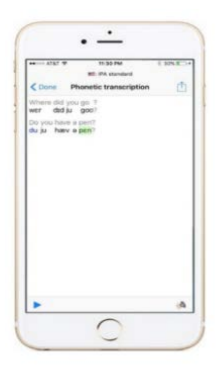
Figure 6. ToPhonetics app speech function.