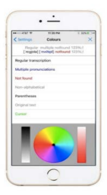
Figure 4. ToPhonetics app colors.

"Speech rate" refers to an option on the app to listen to the text, described below; it is enough to say now that the speech rate for that option can be adjusted here. The final section of the options is "Feedback", which is how users can give feedback to the developers through several platforms. Feedback on learners' pronunciation is not offered on this app.