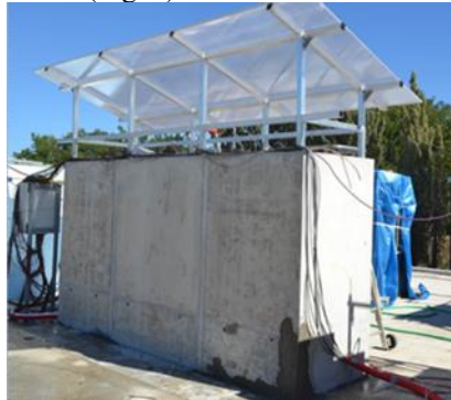
FIGURE 3: In-situ sample (100×200×400 cm<sup>3</sup>) affected by swelling pathologies

- The last scale refers to large concrete elements (100×200×400 cm<sup>3</sup>) simulating a part of a containment building. This will confirm the reliability of the techniques developed at the previous scale in real conditions (Fig. 3)