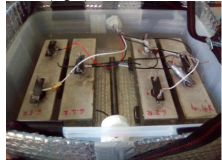
FIGURE 1: Samples (7 \times 7 \times 28 \text{ cm}^3) affected by DEF inside their aging chamber, with acoustic emission sensors on the upper face

- The first scale is based on laboratory samples measuring 7×7×28 cm<sup>3</sup> and allows the sensitivity of NDT to pathologies to be tested under controlled conditions (Fig. 1).