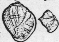
Fig. 663. Fig. 664.

columella incurved, impressed; outer lip acute, expanded and sinuous.