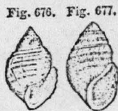
Fig. 676. Fig. 677.

Having before me a number of specimens of Mr. Lea's S. pumilum and of his S. globosum , I am convinced that the latter is an immature form of the former species. The accompanying figures, the largest of which agrees well with Mr.