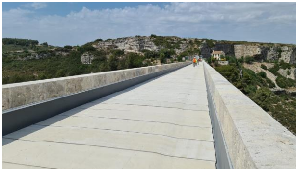
Figure 1 : Slabs

There are many examples, such as Roquefavour slabs (France) with a stone-effect matrix; the awning roof of the Villa Vertigo (Ramatuelle, France) with a around 7 x 11 m (23 x 36 ft) cantilever; the sunshades of the communal building (Etterbeek, Belgium) or the mesh cladding of Flon facade (Lausanne, Switzerland).