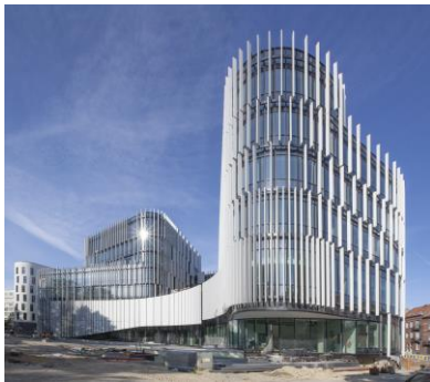
Figure 3 : Sunshades